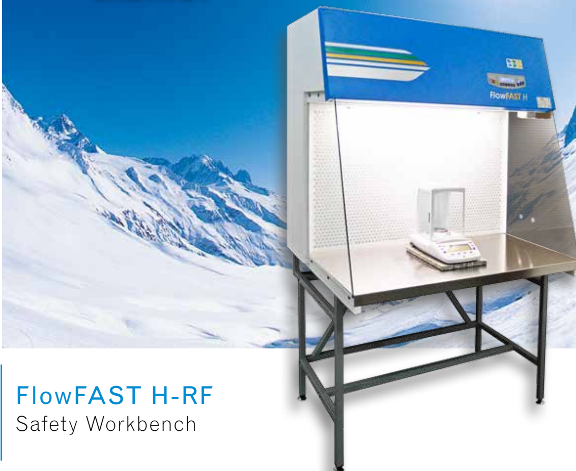
FlowFAST H-RF Safety Workbench